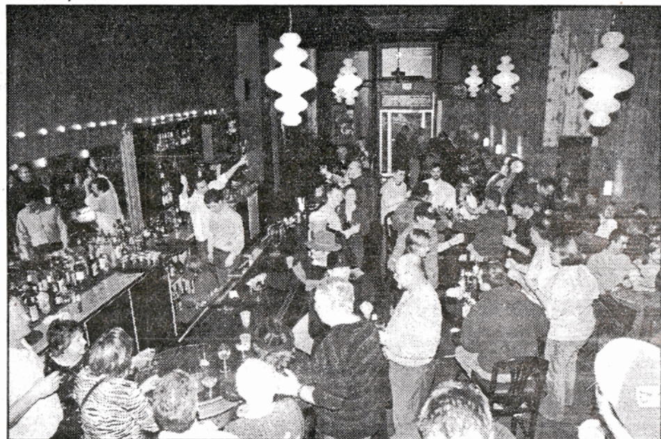
A busy night at Schera's Restaurant and Bar in Elkader.